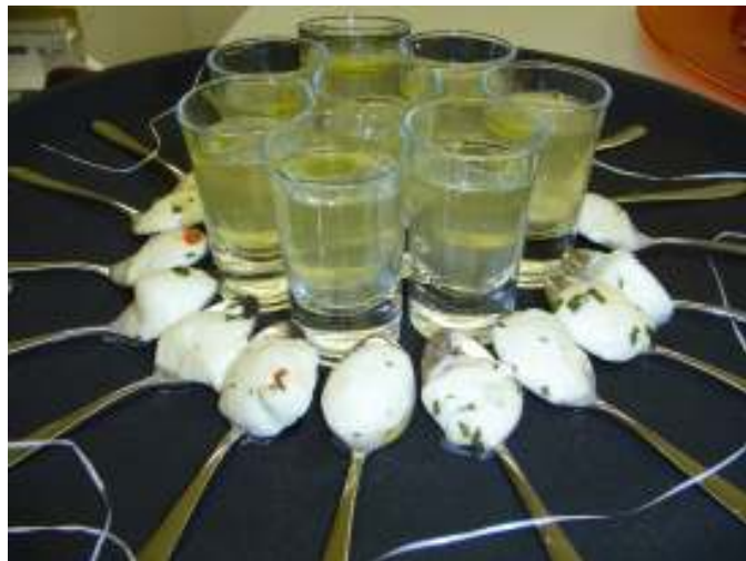
Canapé of marinated Buffalo Mozzarella with a "chaser" of Tomato Consommé